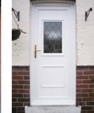
uPVC back door panel with diamond leaded glass

uPVC Mahogany with midrail, vertical mullion and Edwardian half panel