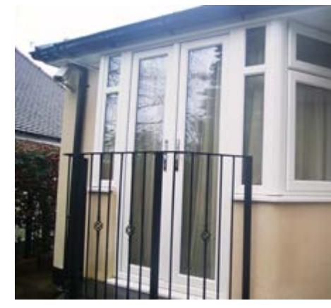
White French doors with chrome handles in centre of bay