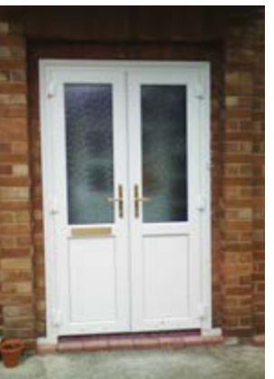
uPVC French doors with midrail and plain panels to lower section