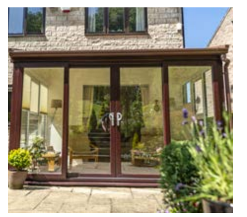
2 pane woodgrain inline sliding patio door with silver handle