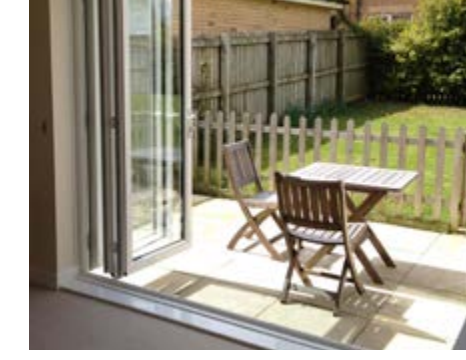
3 pane white bi-folding doors