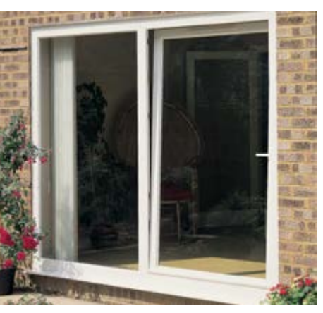
2 pane white tilt and slide patio with white external handle