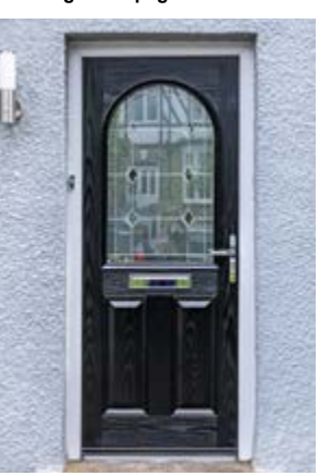
Black Elegance Arch style composite with Palma glass