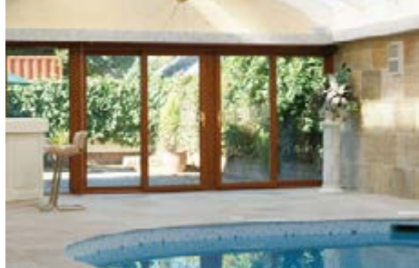
4 pane golden oak inline sliding patio with two gold handles