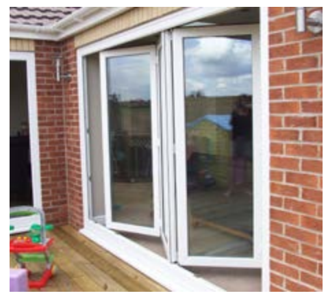
4 pane white bi-folding doors