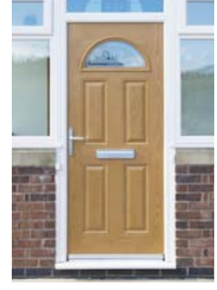
Oak Eclat Arch style composite with sidelights and number etched glass design

Green Esprit C09 style composite with etched glass