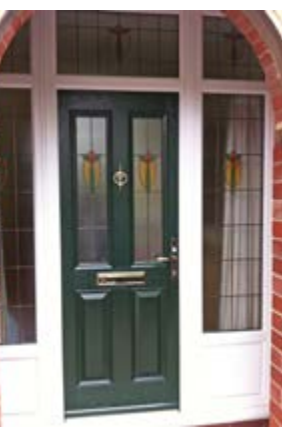
Green Esteem style composite in arched frame with bespoke coloured lead stained glass design

Red Eclat style composite with Andaman zinc glass