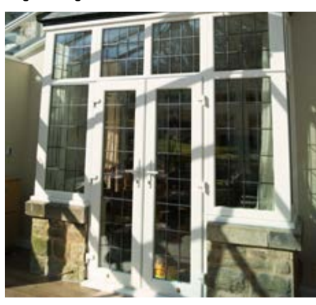
White French doors with white handles, sidelights, toplights and square lead