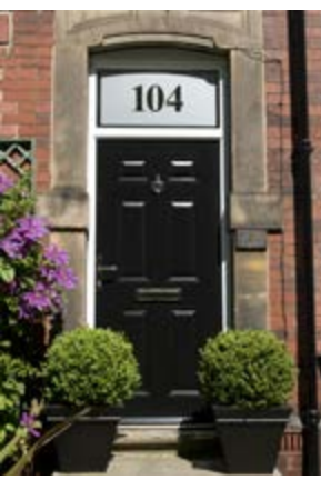
Black solid 6 panel composite with etched glass toplight