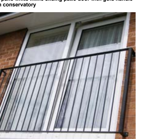
First floor, 2 pane white tilt and slide patio as part of Juliette balcony