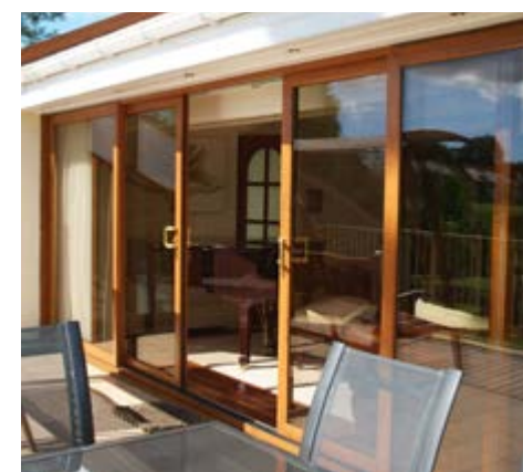
4 pane golden oak inline sliding patio with two gold handles