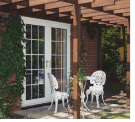
White French doors with gold handles and Georgian fret