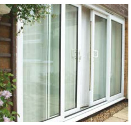
4 pane white inline sliding patio with two white handles