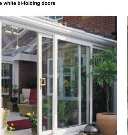
2 pane white inline sliding patio door with gold handle in conservatory