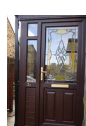
glass, sidelight, midrail and transom

mullion with sidelights, also with midrails