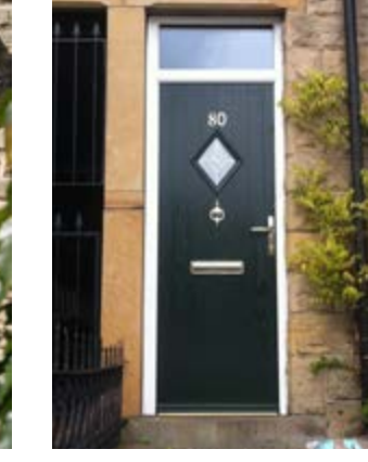
Black Renown Diamond composite with diamond Andaman brass glass