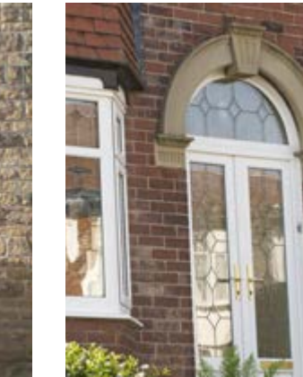
White French front doors with arched toplight and lead design

White French doors with gold handles and Georgian fret