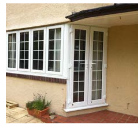
White French doors with white handles and Georgian fret