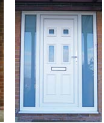
uPVC Edwardian 4 panel with fully glazed sidelights