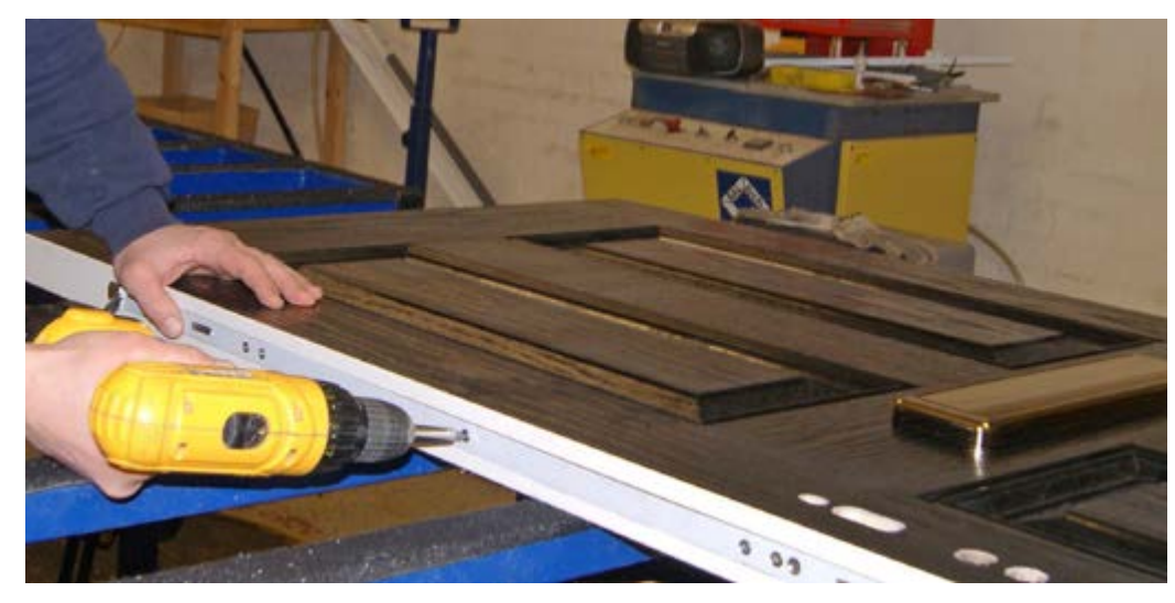
Door security features being installed in our factory