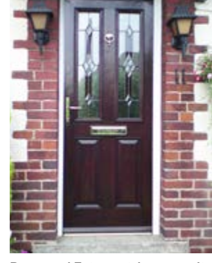
Rosewood Esteem style composite with Roman bevel glass design