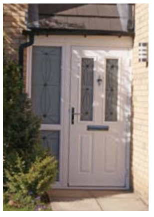
White Esteem style composite with sidelight and bespoke etched and bevelled glass design