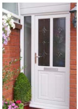
uPVC with midrail, vertical mullion and inverted Edwardian half panel