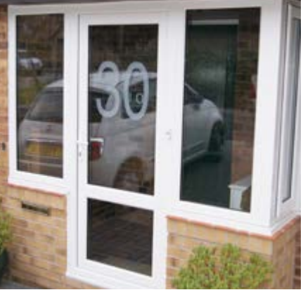
uPVC with midrail and Victorian half panel to lower section