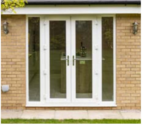
White French doors with chrome handles and full height sidelights