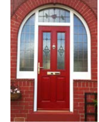
Red Esteem style composite in arched frame with lead and bespoke bevel glass design