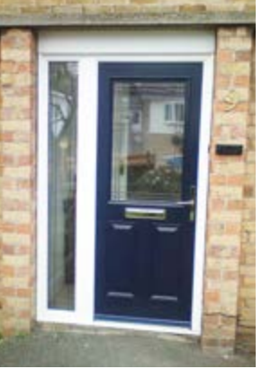
Blue Elegance style composite with sidelight and border lead