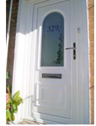
uPVC with Devon panel and etched glass design