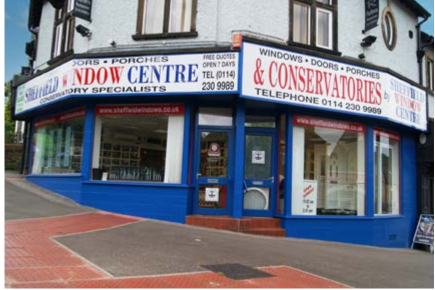
Nether Green Showroom, Oakbrook Road

First impressions count - and when it comes to your home this has never been truer than in the case of a front door. Whether you want to improve your home security, replace a draughty or outdated timber door or simply achieve that much sought after 'kerb appeal', Sheffield Window Centre can offer you the perfect solution for your home.