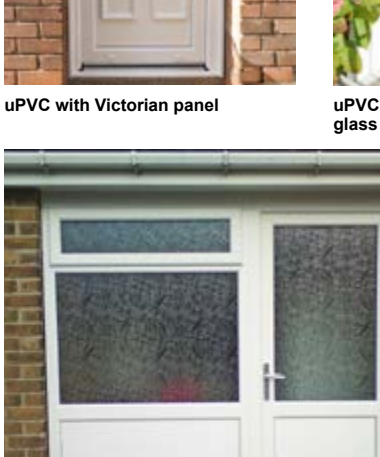
uPVC door and sidelight with midrail and plain panel to lower section