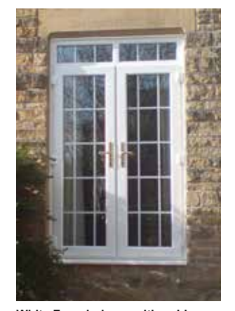
White French doors with gold handles and Georgian fret