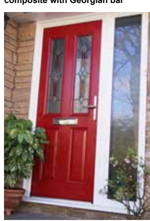
Red Esteem style composite with Roman bevel design and fully glazed sidelight