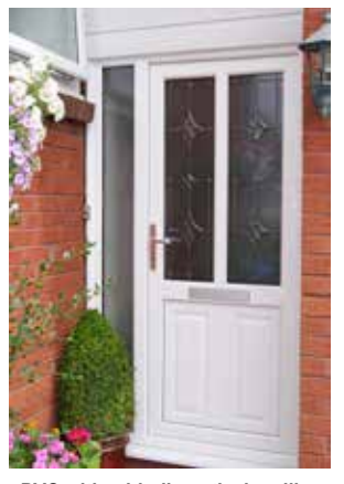
uPVC with midrail, vertical mullion and inverted Edwardian half panel