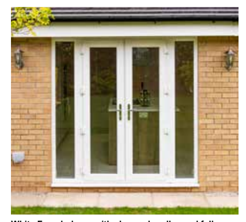
White French doors with chrome handles and full height sidelights