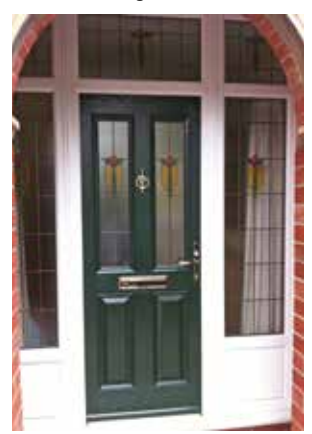
Green Esteem style composite in arched frame with bespoke coloured lead stained glass design