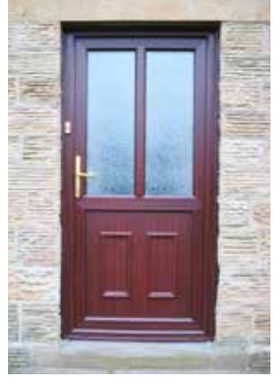
uPVC Mahogany with midrail, vertical mullion and Edwardian half panel