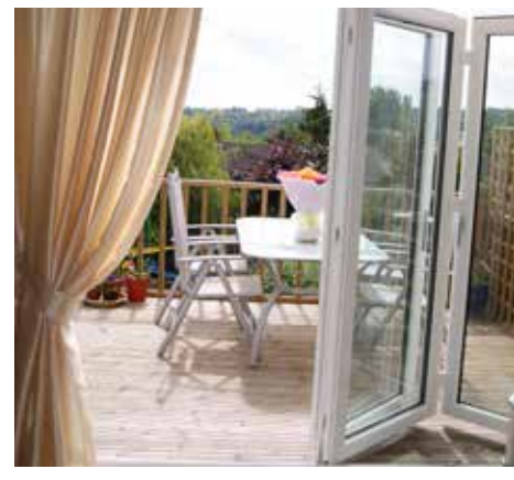
4 pane white bi-folding doors