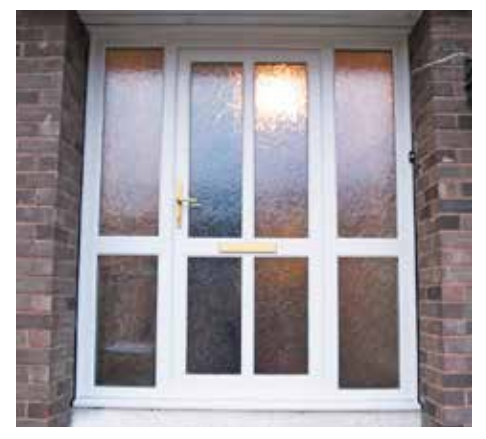
uPVC door with midrail and top to bottom vertical mullion with sidelights, also with midrails