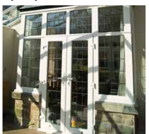
White French doors with white handles, sidelights, toplights and square lead