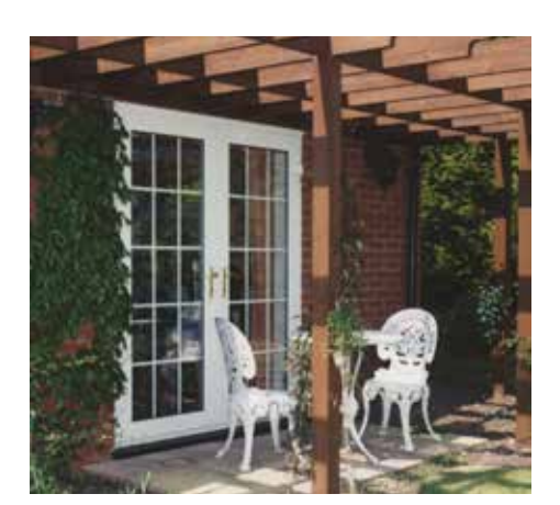
White French doors with gold handles and Georgian fret