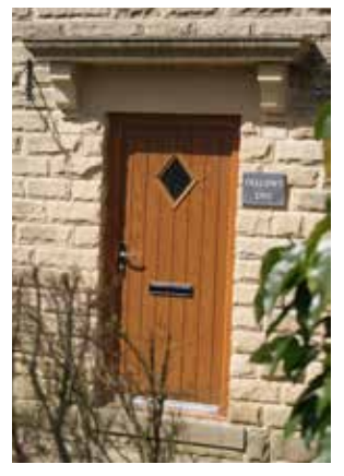
Golden oak Renown Diamond style composite with diamond glass