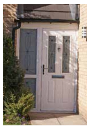
White Esteem style composite with sidelight and bespoke etched and bevelled glass design