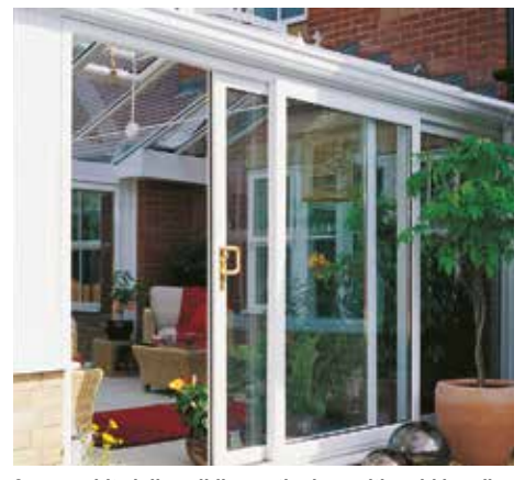
2 pane white inline sliding patio door with gold handle in conservatory