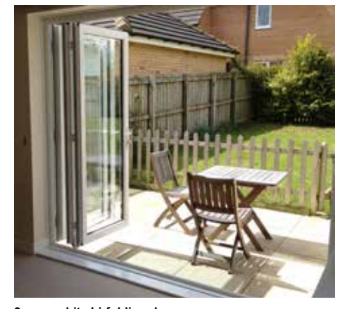
3 pane white bi-folding doors