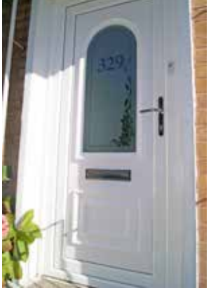
uPVC with Devon panel and etched glass design