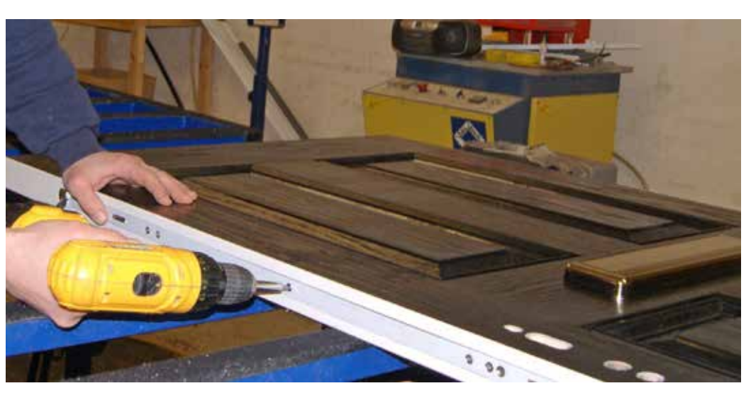
Door security features being installed in our factory