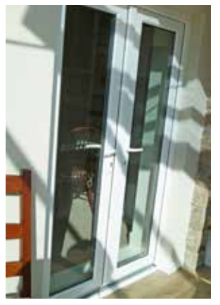
White French doors with white handles