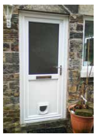
uPVC with midrail and plain panel to lower section with cat flap