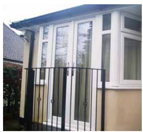
White French doors with chrome handles in centre of bay