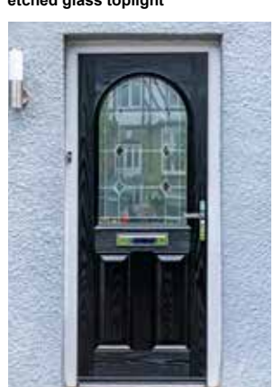
Black Elegance Arch style composite with Palma glass