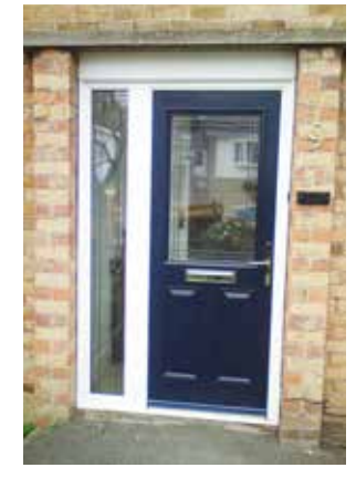
Blue Elegance style composite with sidelight and border lead