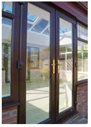
Rosewood French doors with gold handles in conservatory