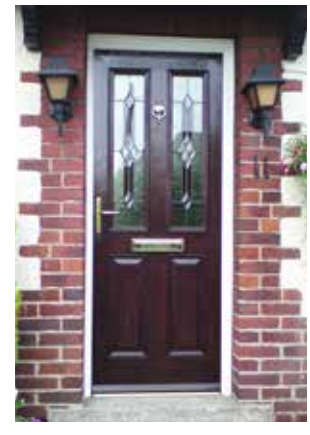
Rosewood Esteem style composite with Roman bevel glass design