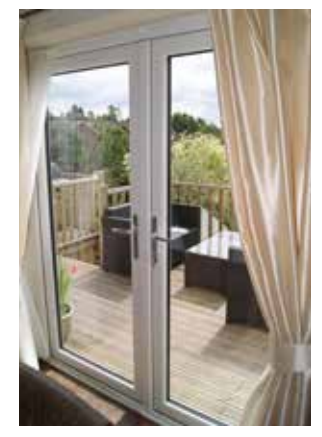
White French doors with chrome handles