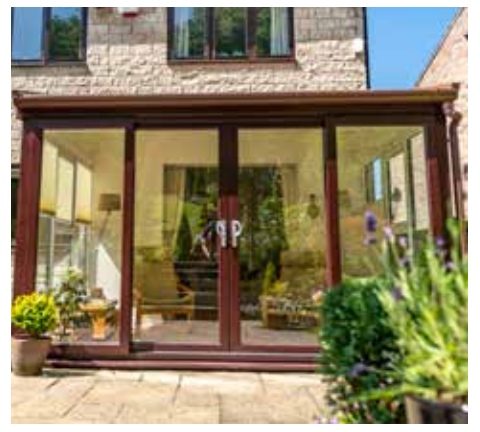
2 pane woodgrain inline sliding patio door with silver handle