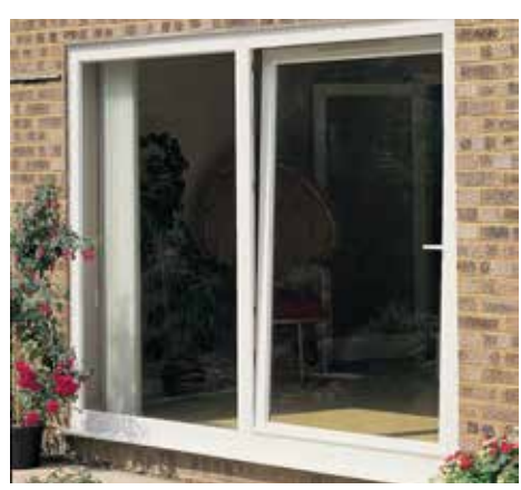
2 pane white tilt and slide patio with white external handle