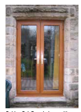
Golden Oak French doors with chrome handles