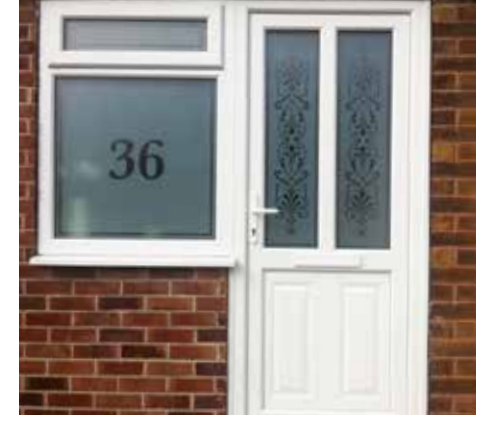
uPVC door and window with etched glass, midrail and vertical mullion