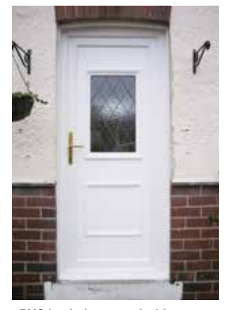
uPVC back door panel with diamond leaded glass