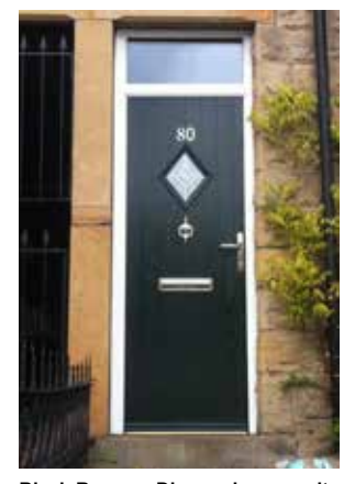
Black Renown Diamond composite with diamond Andaman brass glass