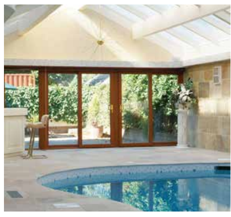
4 pane golden oak inline sliding patio with two gold handles