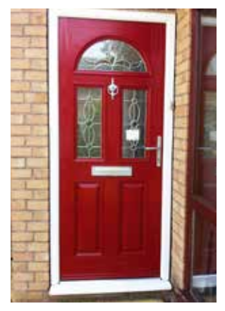
Red Eclat style composite with Andaman zinc glass