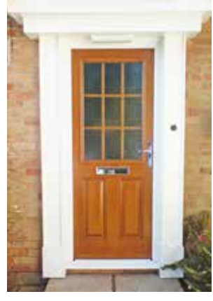
Golden Oak Elegance style composite with Georgian bar