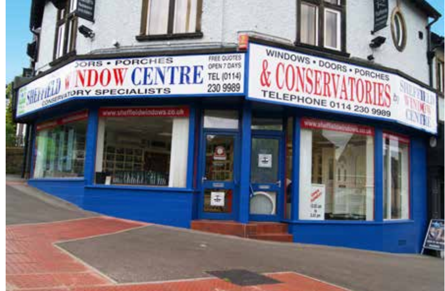
Nether Green Showroom, Oakbrook Road

rist impressions count - and when it comes to your home this has never been truer than in the case of a front door. Whether you want to improve your home security, replace a draughty or outdated timber door or simply achieve that much sought after 'kerb appeal', Sheffield Window Centre can offer you the perfect solution for your home.