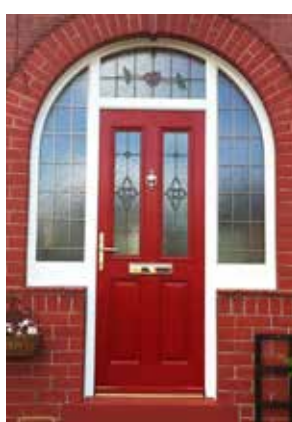
Red Esteem style composite in arched frame with lead and bespoke bevel glass design