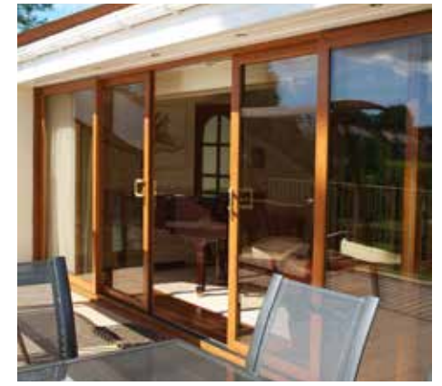
4 pane golden oak inline sliding patio with two gold handles