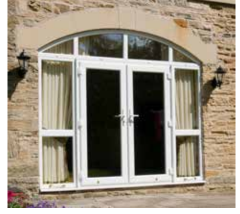
French doors with white handles, arched toplight and sidelights with midrails