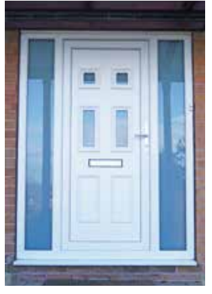
uPVC Edwardian 4 panel with fully glazed sidelights