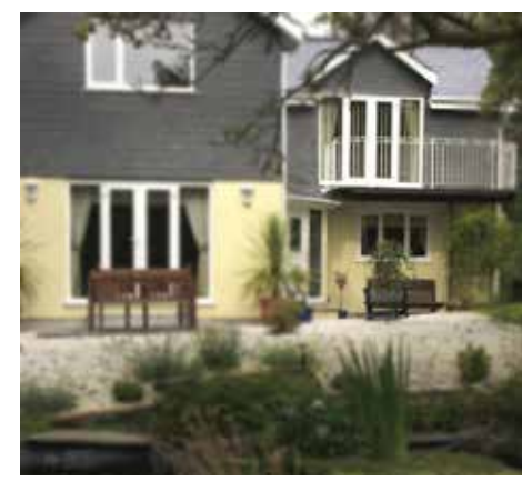
First floor, white French doors with sidelights