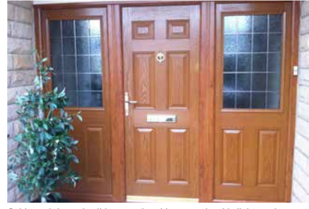
Golden oak 6 panel solid composite with composite side lights and square lead in top section