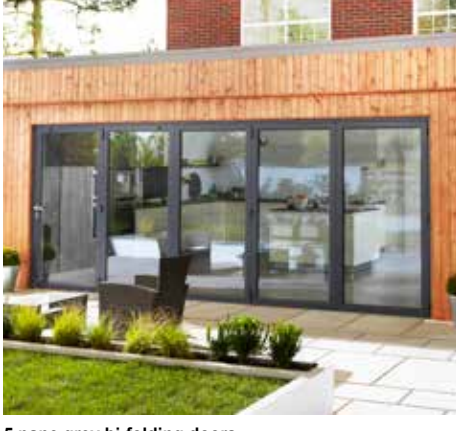
5 pane grey bi-folding doors