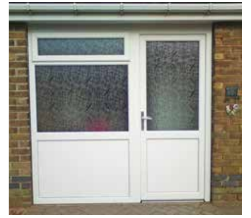
uPVC door and sidelight with midrail and plain panel to lower section