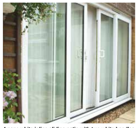
4 pane white inline sliding patio with two white handles