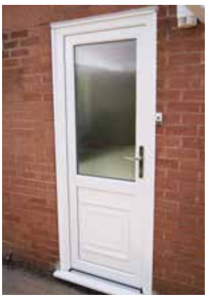
uPVC with midrail and Victorian half panel to lower section