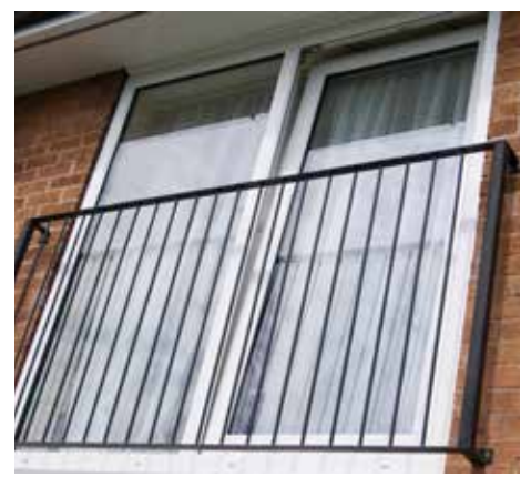
First floor, 2 pane white tilt and slide patio as part of Juliette balcony