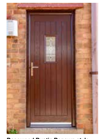
Rosewood Rustic Renown style composite with Kara glass design