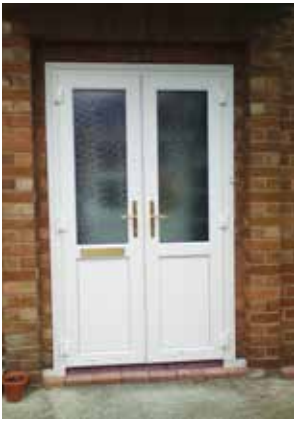
uPVC French doors with midrail and plain panels to lower section

∧ II of our doors are Amade-to-measure and with so many designs, colours and finishes to choose from, the possibilities are endless! The following pages show a selection of doors we have manufactured in the past to give you some ideas and inspiration.