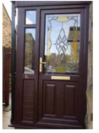
uPVC Rosewood with decorative glass, sidelight, midrail and transom