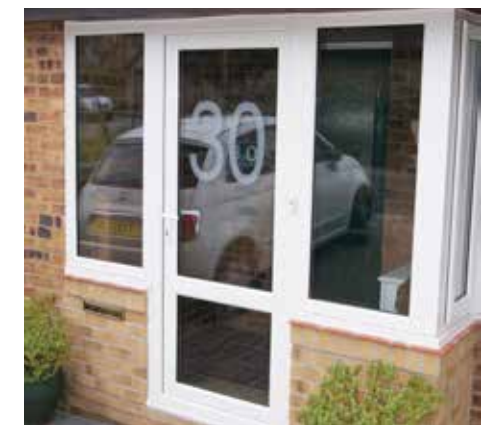
uPVC door with midrail, glazed top and bottom with an etched number in top section