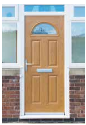
Oak Eclat Arch style composite with sidelights and number etched glass design