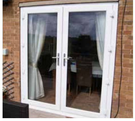
White French doors with silver handles