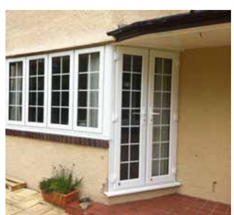
White French doors with white handles and Georgian fret