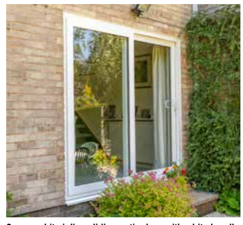
{\bf 2} pane white inline sliding patio door with white handle